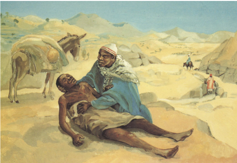
The Good Samaritan, JESUS MAFA, 1973