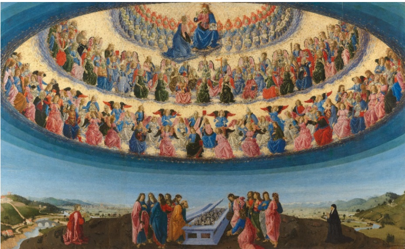
The Assumption of the Virgin, Francesco Botticini (1446-1498)