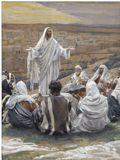
Lord's Prayer, James Tissot (1836-1902)