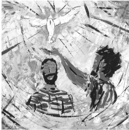
Baptism of Jesus, Liz Valente (2021)