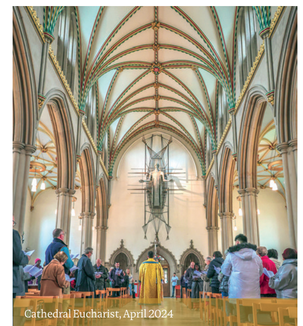
Cathedral Eucharist, April 2024

upgrading took place. The transfer of data into the Cloud has improved data security and over time will save money on infrastructure. A rolling programme to replace aging hardware and to standardise equipment is in place to make future maintenance easier.