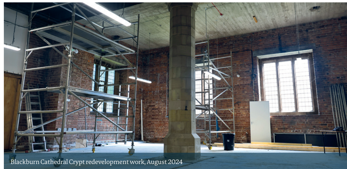
Blackburn Cathedral Crypt redevelopment work, August 2024

We are delighted that the Changing Places facility formed part of the plans and is now operational.