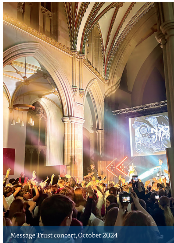
Message Trust concert, October 2024