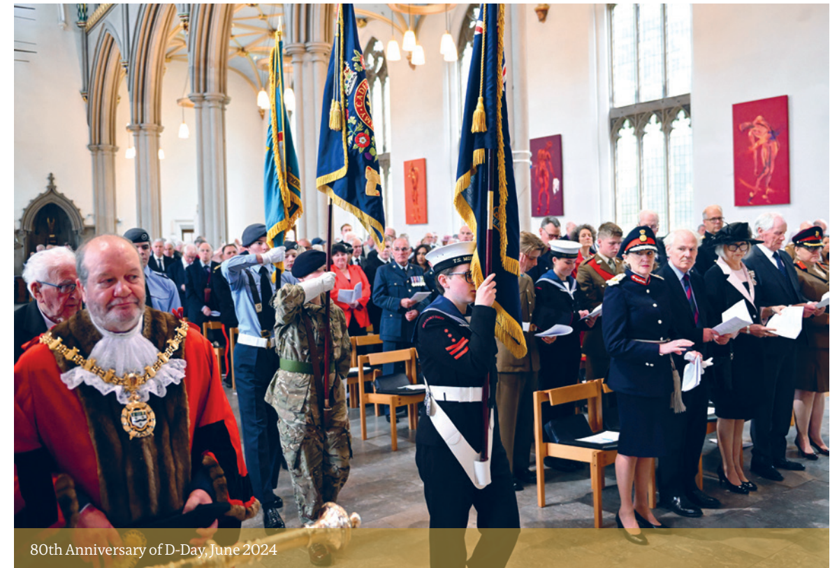
80th Anniversary of D-Day, June 2024

As far back as November 2022 the Chapter had been informed that a BBC investigation into the Church of