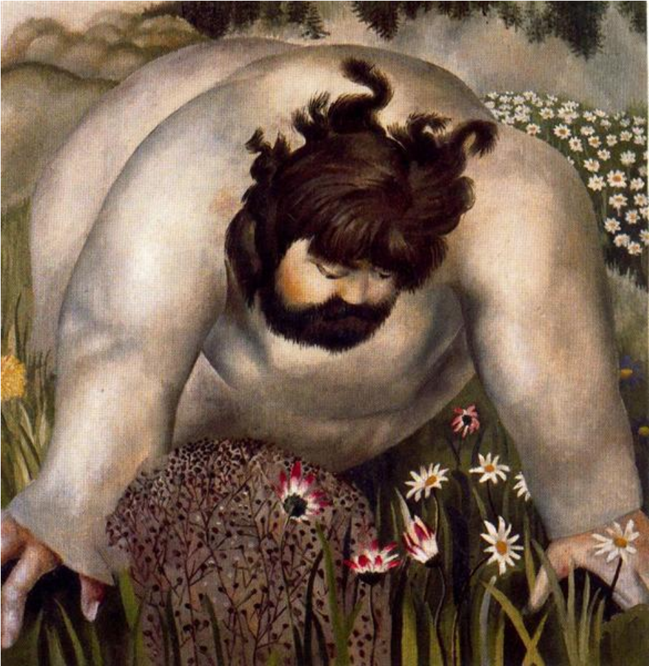
Christ considers the Lilies in the wilderness, Stanley Spencer